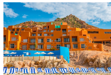
CLUB REGINA LOS CABOS

Located on the 1 st floor of north tower "A"