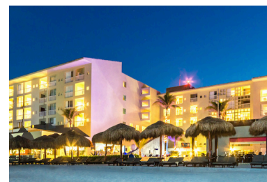
CLUB REGINA CANCUN

Located on the 1 st floor of building "D"