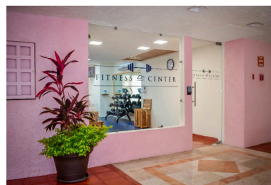
CLUB REGINA PUERTO VALLARTA

We know not everyone associates fitness with vacations, but we hope those who do will be pleased with what we have created and those who don't might be inspired to come give it a try!