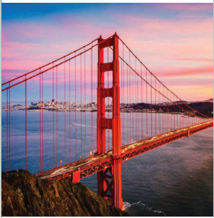
DISCOVER SAN FRANCISCO

Scored tickets to a Broadway show in New York City? Want to explore San Diego before a cruise? Looking to meet up with friends for an epic weekend in Miami?