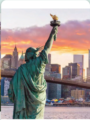
DISCOVER NEW YORK CITY