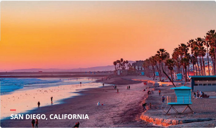
SAN DIEGO, CALIFORNIA

For More Details Visit RCI.COM/RAINTREEEXCHANGEPLUS Or Call A Travel Guide.